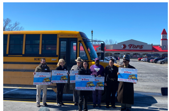
Easter Food Drive Announcement with TOPS Friendly Markets