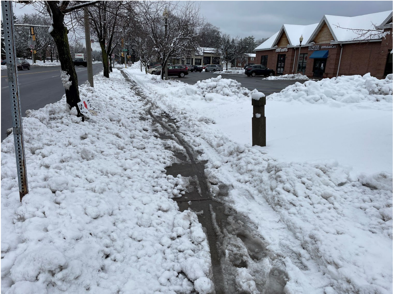
Partially cleared sidewalk on west side of Winton Avenue.