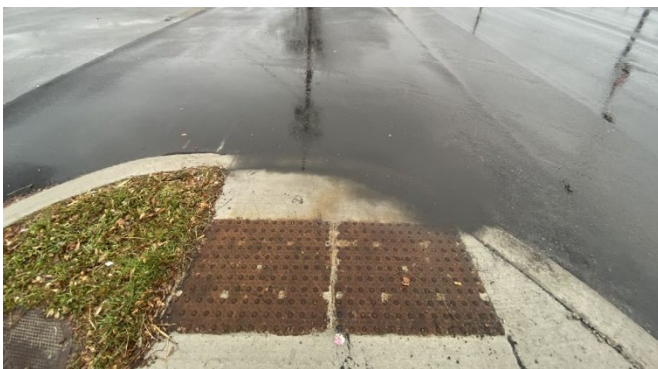
Pooling water at curb ramp