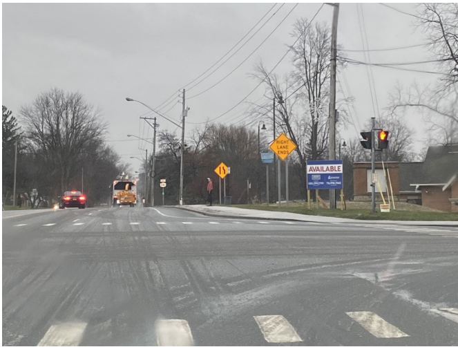
Pedestrian waiting at a bus stop