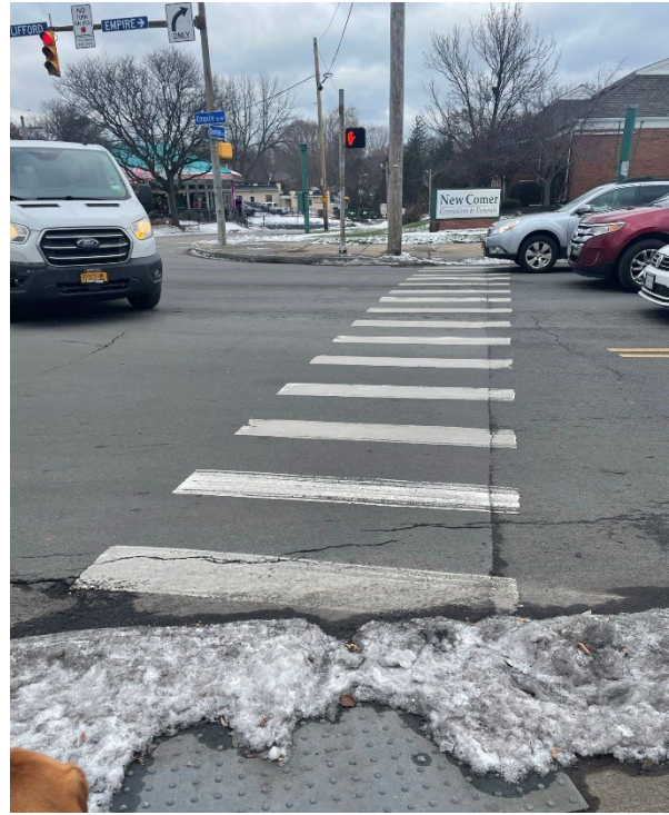
Intersection with Culver Road