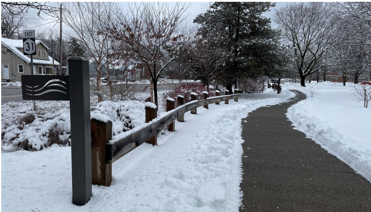
Clear permeable pavement on side path along Monroe Avenue at Twelve Corners Middle School

NOTE: Permeable concrete sidewalks, west side of Monroe at Middle School, are in very good condition and completely free of snow and standing water. Minimal or no salt was observed along this section of sidewalk.