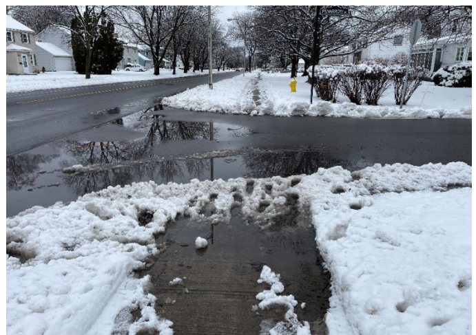
Snow obstructing sidewalk ramps at Penarrow Road