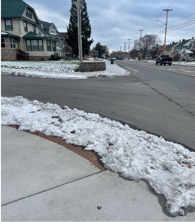
Residential street intersection