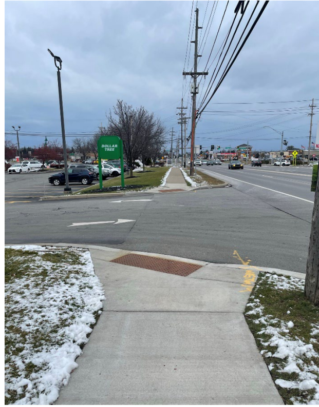
No crosswalk striping at Dollar Tree curb cut