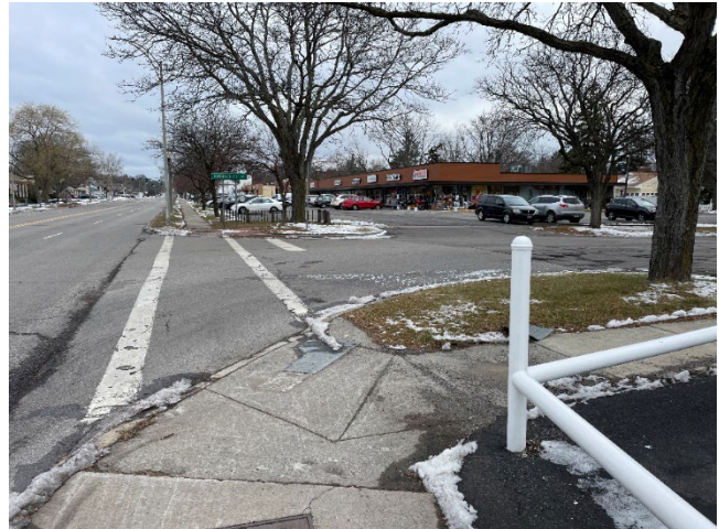
60-foot crossing distance at Rhinecliff Drive