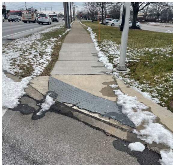
Detectable Warning Strip at the Wegmans Driveway