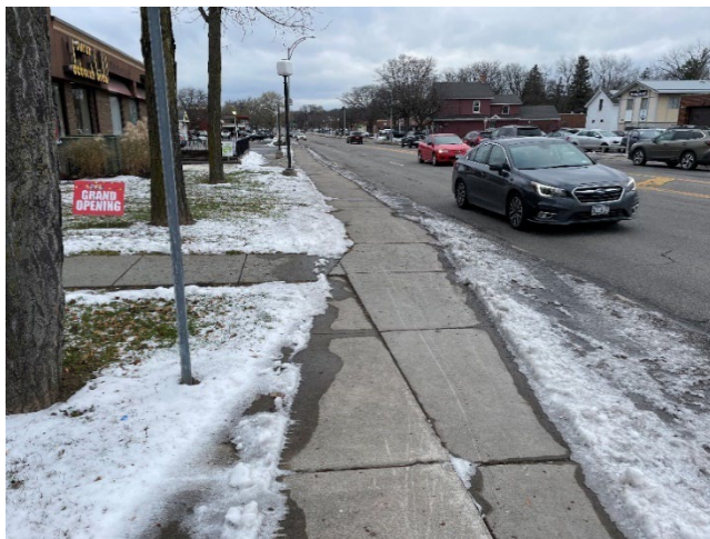
Sidewalk adjacent to roadway