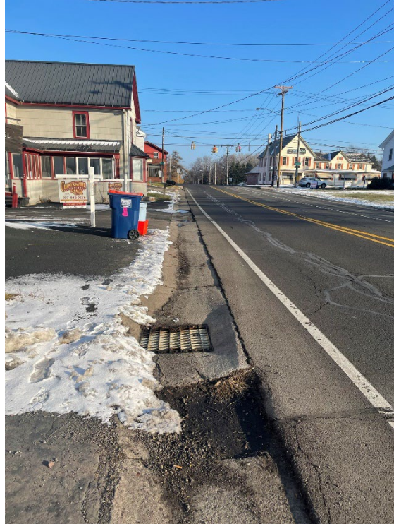
Shoulder on Gravel Road approaching Ridge Road