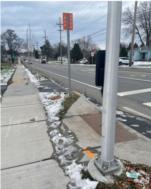
Bus Stop at Shelford Road is not ADA accessible.