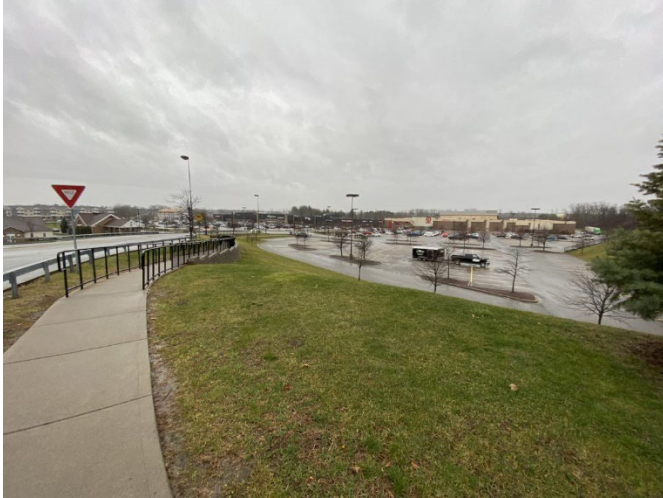
Sidewalk access within a private development