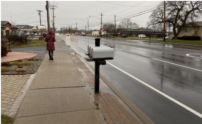
Sidewalk on South Side of Chili Avenue