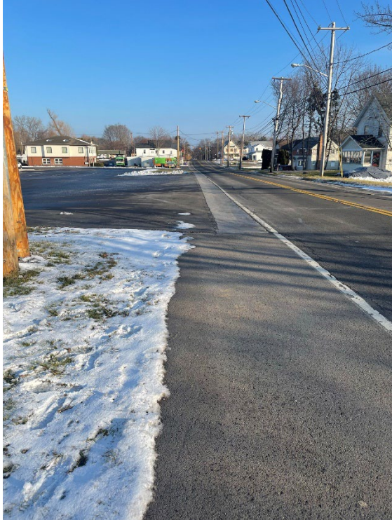
Driveway at the Fire Hall on Gravel Road