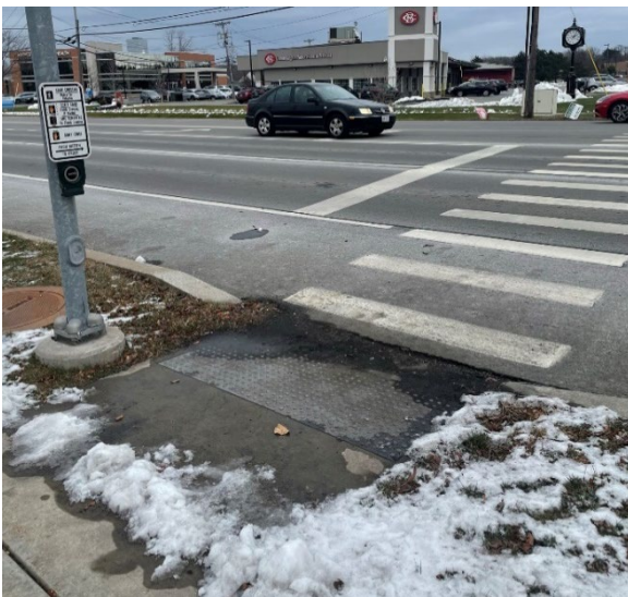
Crossing at Brandt Point Drive