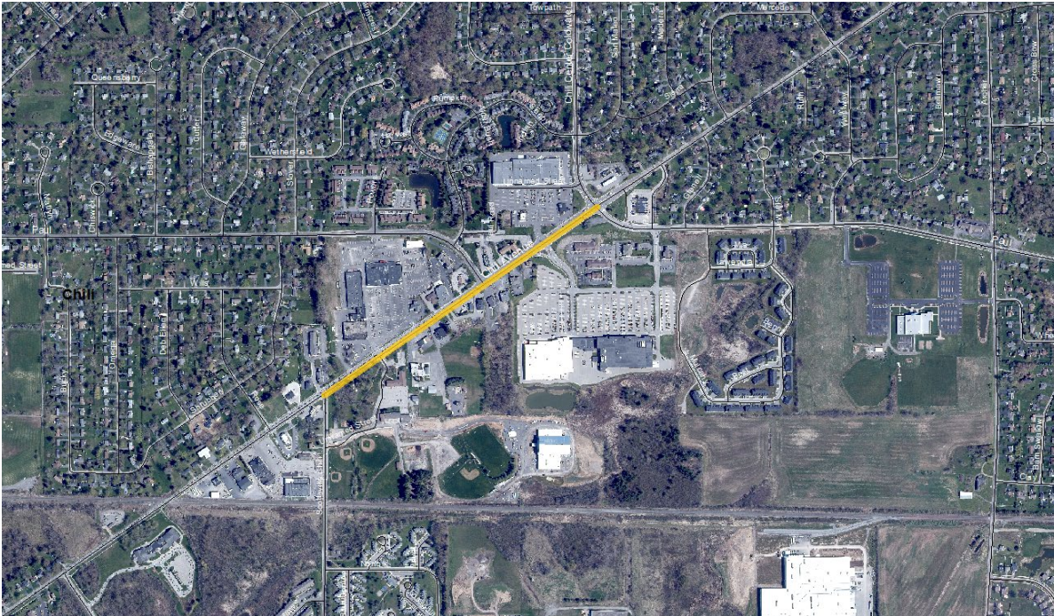
Chili Avenue Segment