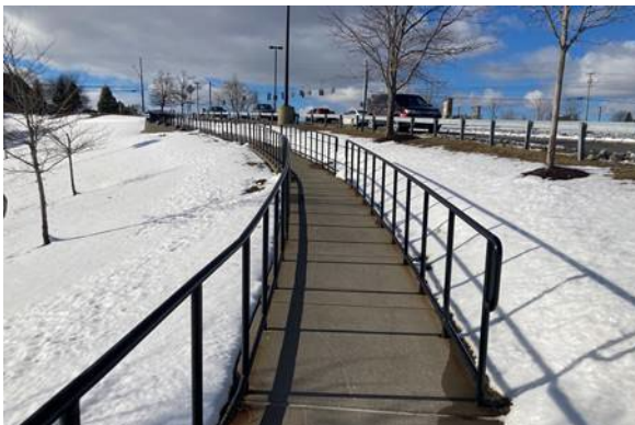
Sidepath within a private development to the Target plaza was cleared.