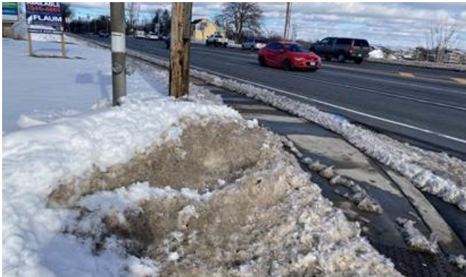
Snow block the access to the signal button and the curb ramp