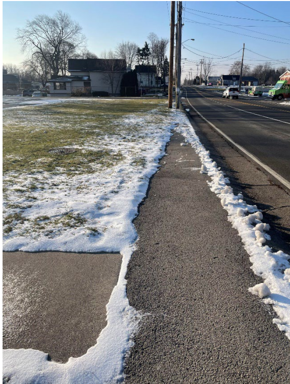
Asphalt path on east side of Gravel Road