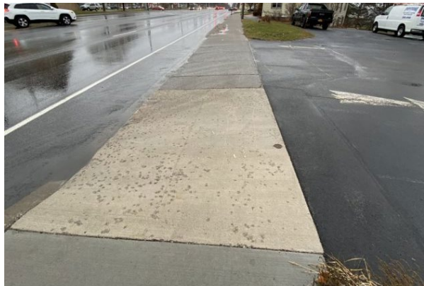
Sidewalk along driveway