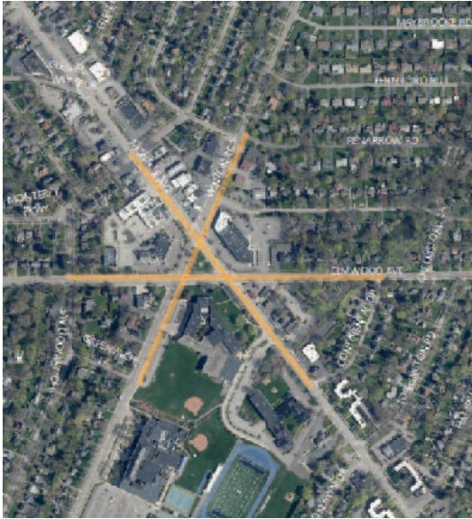
Brighton Roadway Segments