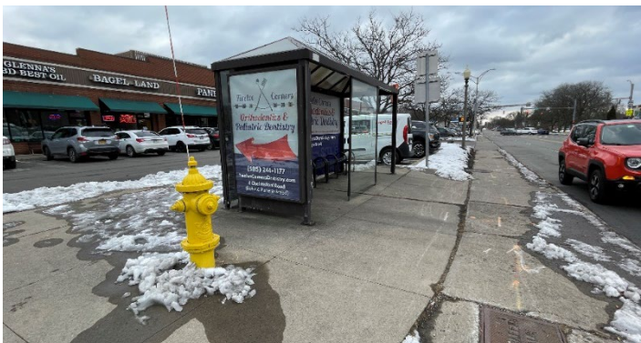
Bus Stop at Winton Road & Monroe Avenue