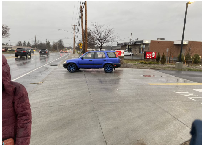
Concrete driveway with multiple access lanes