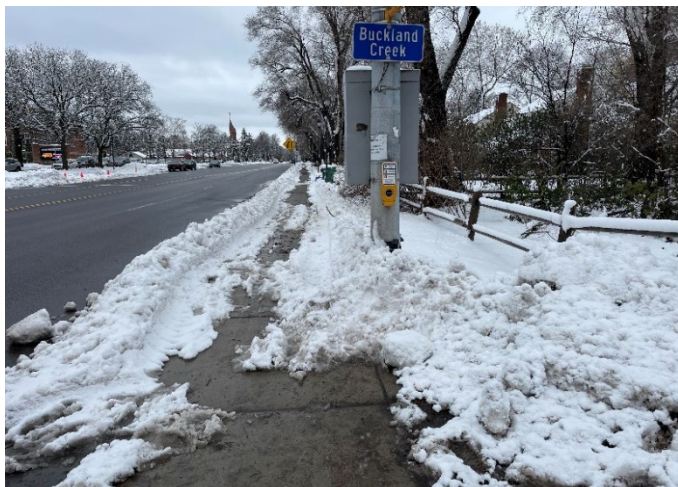
Partially cleared sidewalk at Buckland Creek