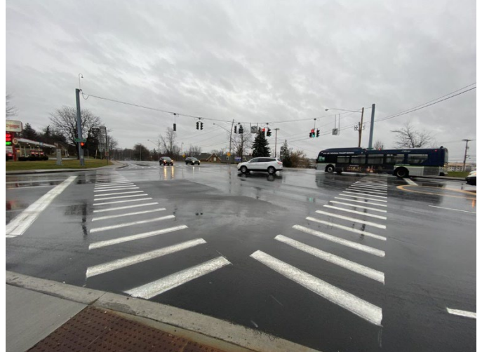
Crosswalk across Route 33 looking east