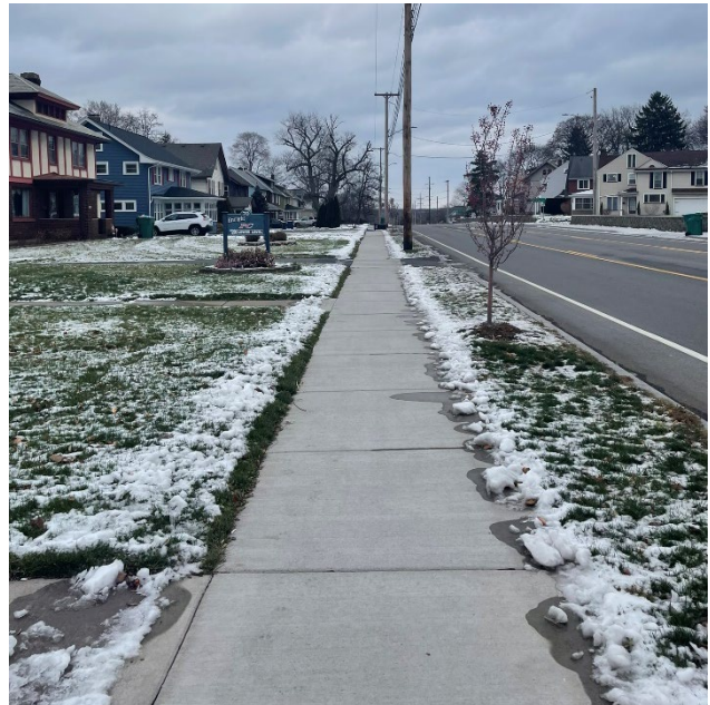
Excellent pavement condition and new street trees