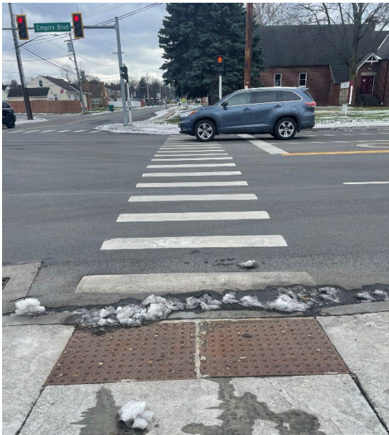
Crossing at Helendale Road