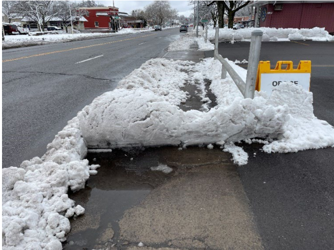
Plowed snow blocking sidewalk at Sunoco Gas Station