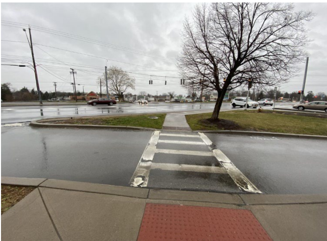
Crosswalk across slip lane to pedestrian island