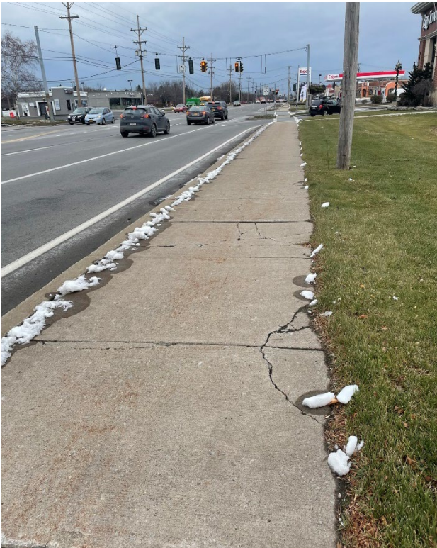
Some cracking on sidewalk