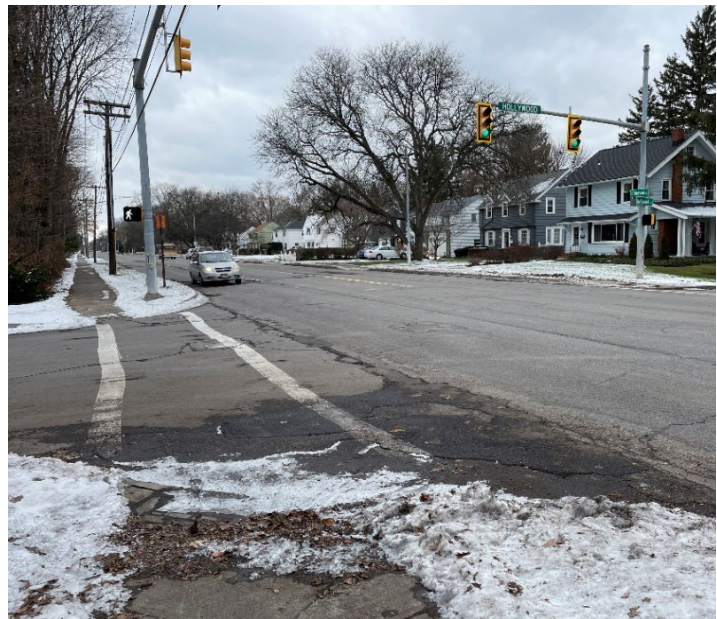
Elmwood Avenue and Hollywood Avenue Intersection