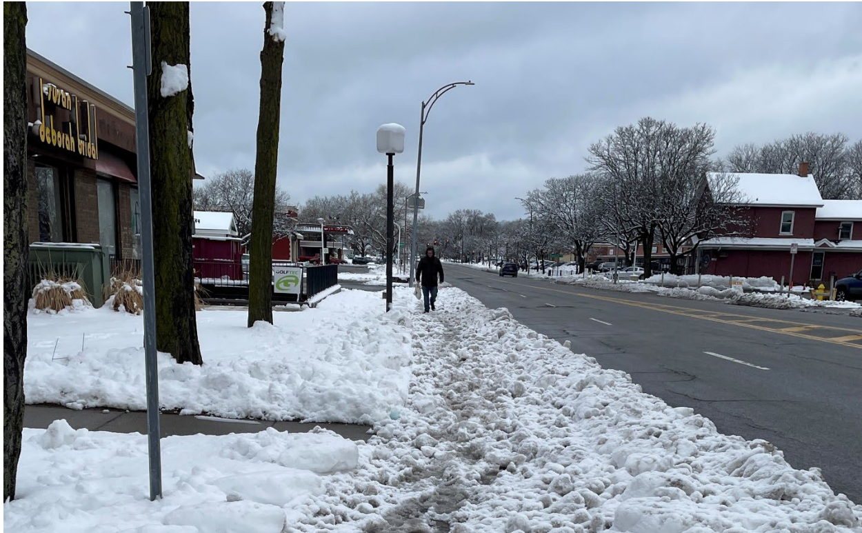
Unplowed sidewalk on the west side of Monroe Avenue north of Twelve Corners