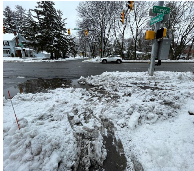
Residential Driveway on Elmwood east of Hollywood Elmwood & Hollywood Intersection