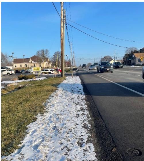
Shoulder on the west side of Empire