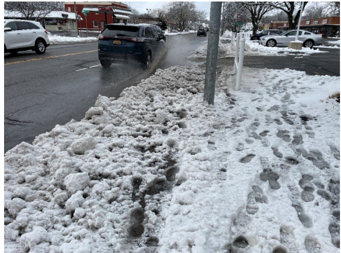
Unplowed Sidewalk on east side of Monroe north of Twelve Corners