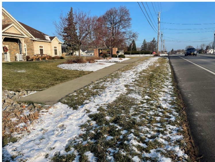
Sidewalk in front of Innovative Dental Health & Wellness