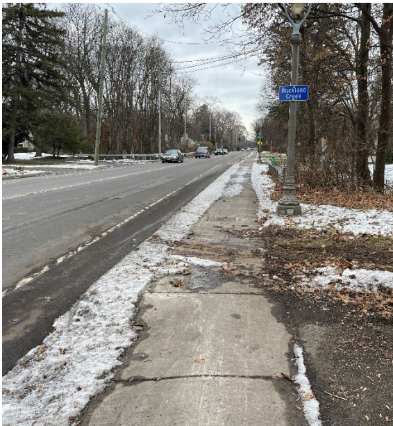
Sidewalk Surface Condition near Buckland Creek