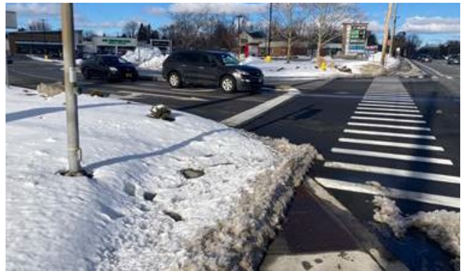
Snow clearing missed the curb ramp