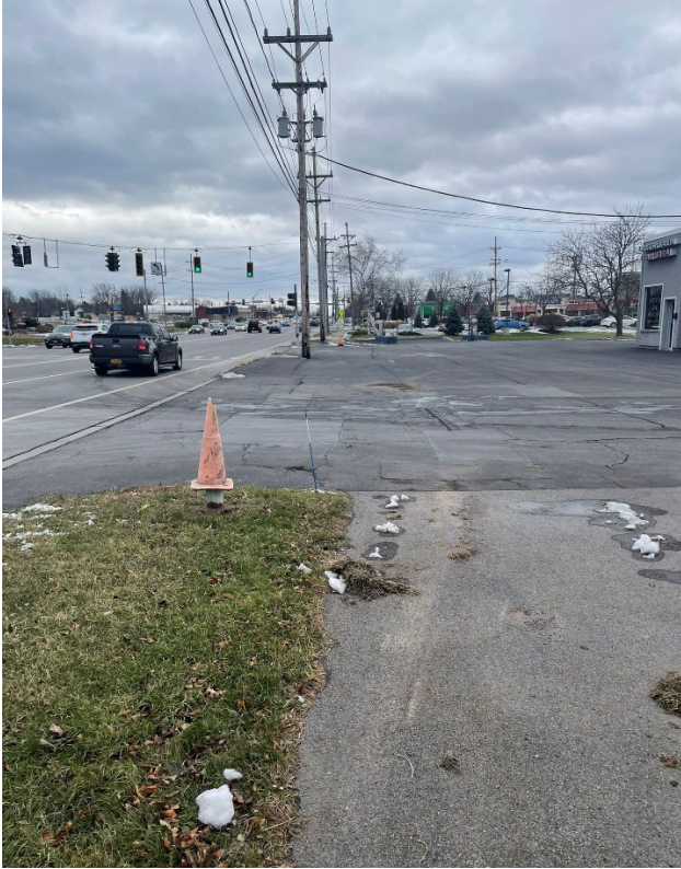
Laser Cash Car Wash – No sidewalks present