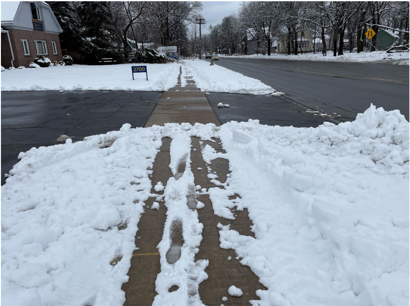
2700 Elmwood Avenue