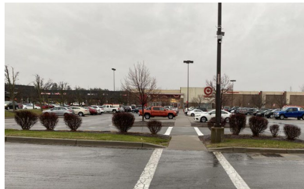
Pedestrian Access to a commercial area not along the roadway and path is within a private development