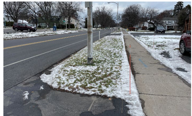
Tree Lawn on Winton Road with no street trees