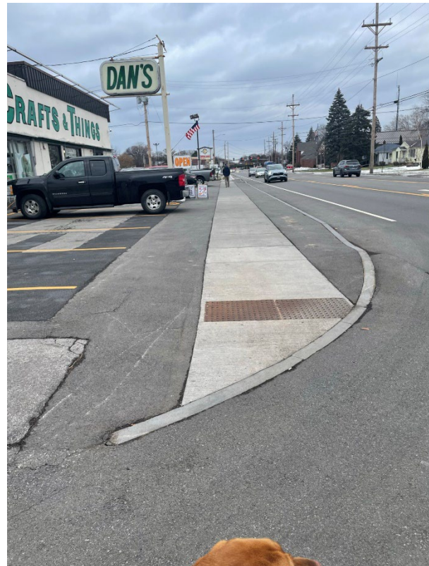
Dans Craft and Things Parking Area