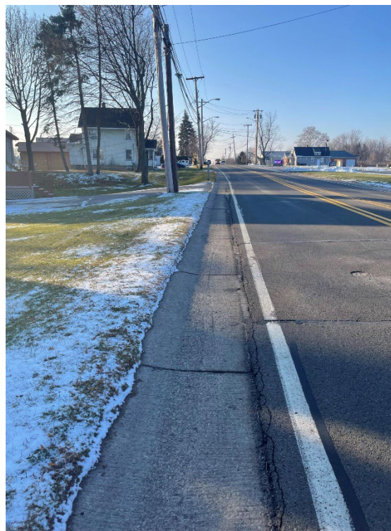
Shoulder on east side of Gravel Road